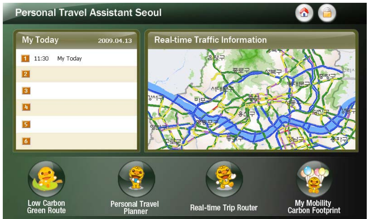
Figure 2. Seoul PTA Shows Planned Personal Travel with Real-Time Traffic Information

Seoul PTA incorporates “virtual assistant” features that provide transit guidance based on user preferences and trip context (for instance, whether time is more critical than expense for a particular trip), employing real-time traffic and public transportation information. PTA consists of four key features: