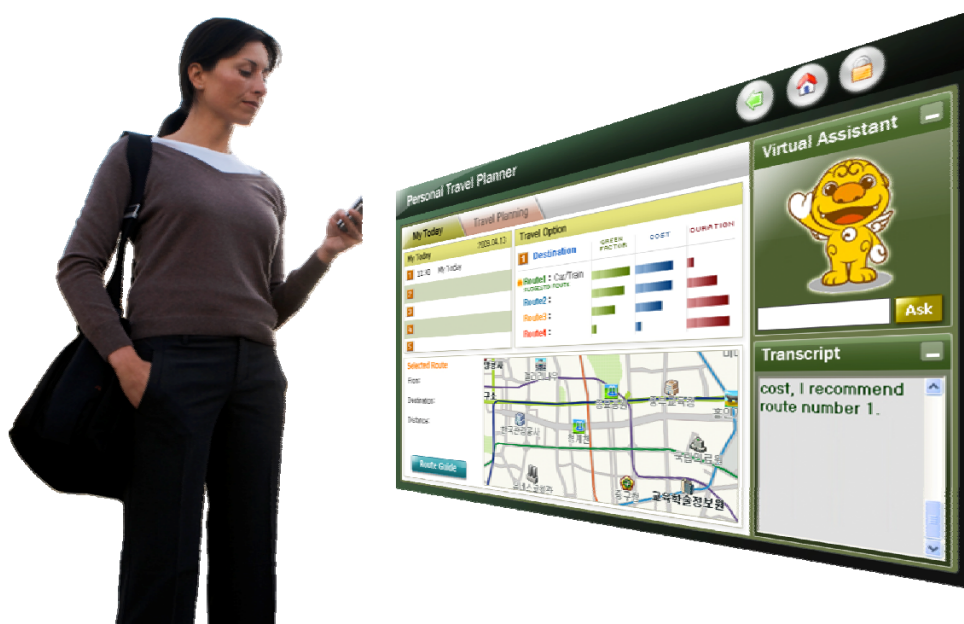
Figure 1. Personal Travel Assistant for Informed Urban Citizens

A Connected Urban Development (CUD) pilot initiative, PTA is a web-based service developed by Cisco Internet Business Solutions Group (IBSG), the company's global strategic consulting arm, in partnership with the cities of Seoul and Amsterdam. Additional concept development has been provided by the Massachusetts Institute of Technology (MIT) Mobile Experience Lab. 1 PTA enables cities to provide users with travel information in a convenient format through various channels, including smartphones, PDAs, websites, transit stations and vehicles, and personal computers.